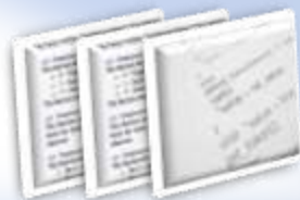
SDKs For PCs, PDAs, Smartphones...