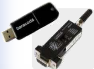
Plug & Scan Dongles USB / RS232