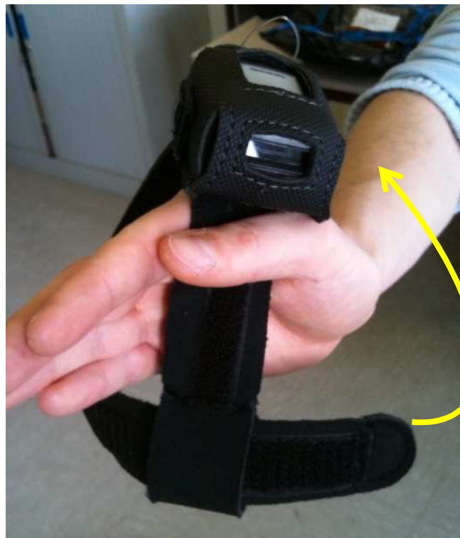
Example : for right-handed

For Left-Handed : Put the lanyard into the loop from ITS LEFT