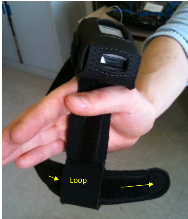
Example : for right-handed

For Right-Handed : Put the lanyard into the loop from ITS RIGHT