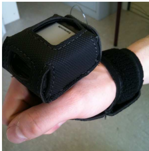
Example : for right-handed